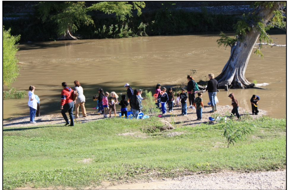
Students and parents head to the river with hopes of finding treasure.